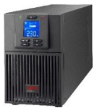
Easy UPS 1K & 2K Tower